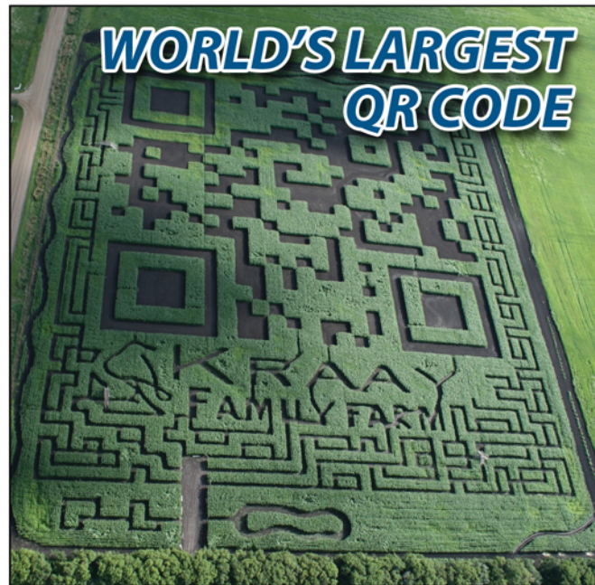
Guinness Book of World Records officially declared Kraay Family farm, located in Lacombe, Alberta, Canada, the owner of the world's largest QR code. The code sends people to the farm's website.

In 1994 Denso Wave Inc., a global automotive components manufacturer headquartered in Japan, created QR codes for tracking vehicle parts. This was the beginning of the QR code invasion in Japan.